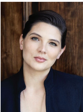
Taylor Jenkins Reid, author of numerous books